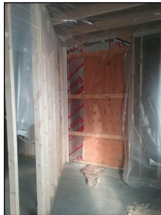
Future hallway opening to Education Wing.

The church addition continues to make progress...slowly but steadily! We are excited to finish! The walls are up and most of the electrical work is done. The new lights and exhaust fans have been put in the sanctuary wing bathrooms.