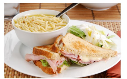
SUNDAY, FEBRUARY 11 (following service) Bring your favorite soup, sandwich, salad or dessert!